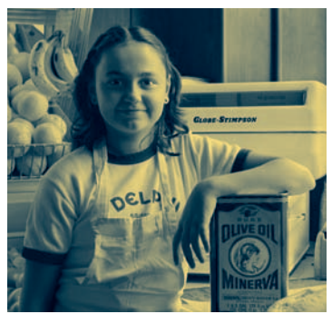
Greek girl at Giavis Market