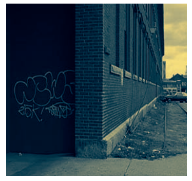
Signs of urban decay