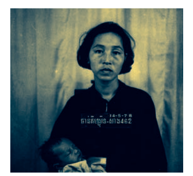
Torture victim with ID label