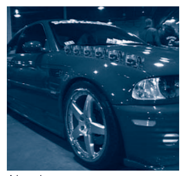
A hot rod