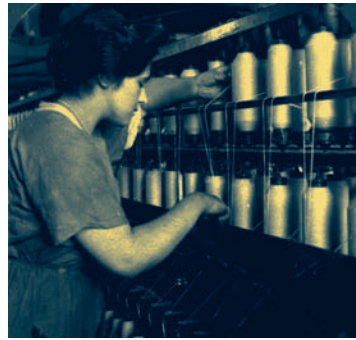
A cotton spinner ca. 1918

These new residents suffered perhaps the most when one of Lowell's major employers, Wang Labs, began to falter in the late 1980s. With unemployment and crime on the rise, Lowell became a dangerous and depressing place to grow up. As the 21st century dawns, Lowell is beginning to diversify its economy, develop more cultural activities, and once again attract new immigrants – now from India. West Africa, and Latin America.