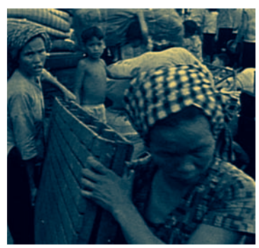
Refugees flee Cambodia